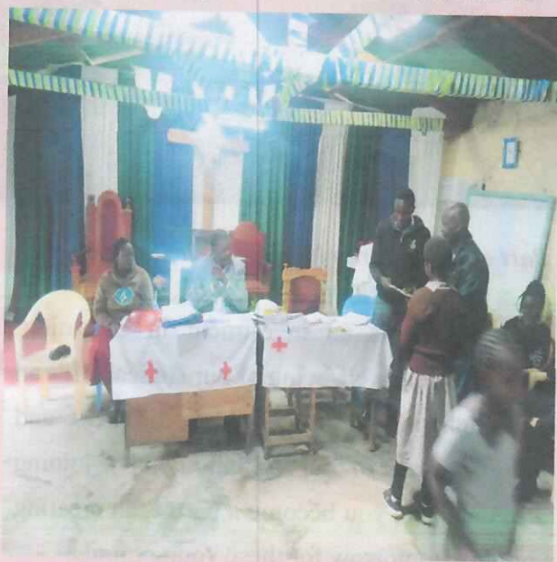
Awarding of the best performing students during school closing assembly

The best performing pupils were rewarded for their excellence and it encourages the other pupils to work harder as well as put effort into their academics.