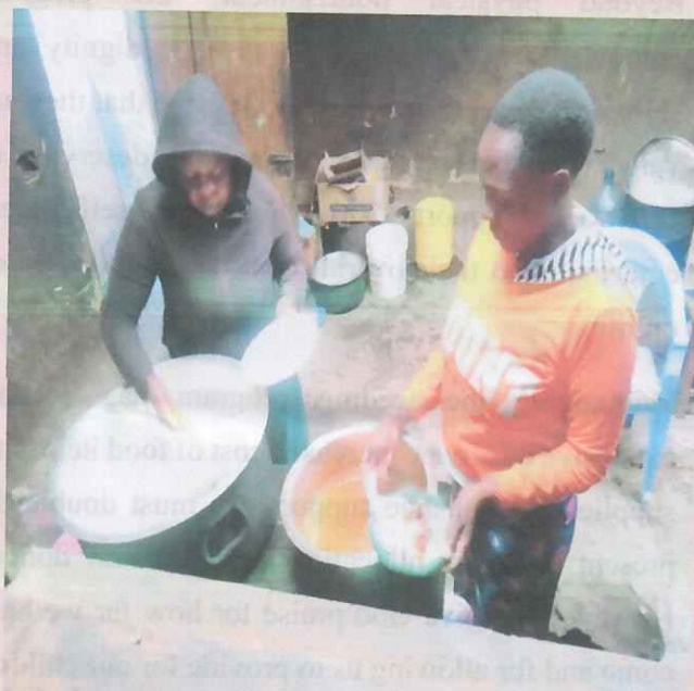
Lunch meal being served in the kitchen

The School Feeding Program has emerged as a ray of hope in the center of Korogocho, an active slum in Nairobi, Kenya, meeting not just the urgent nutritional requirements of children but also building a more promising future for the entire neighborhood. This program has demonstrated its ability to impact lives and build a sense of empowerment, acting as a catalyst for change.