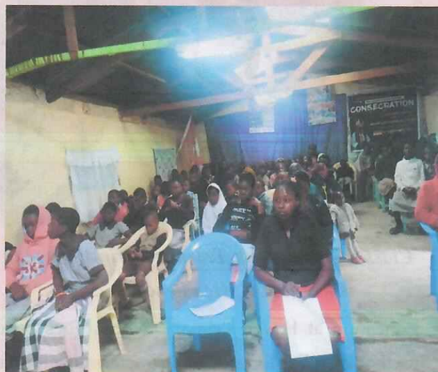
School closing Assembly

We have just closed school for two weeks hence there will be no academic lessons until 23rd August. During this period, we have organized remedial program for the slow learners to help them make progress with their studies. We are immensely proud of the accomplishments our pupils have achieved this past term.