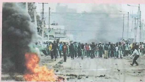
Protests against the high cost of living in Nairobi Kenya

Since the protests were happening on Wednesday to Friday, they also brought disruption of daily routines, affecting residents' access to essential services, education, and work. Road blockades and business closures can exacerbate economic hardships and limited opportunities for earning a livelihood.